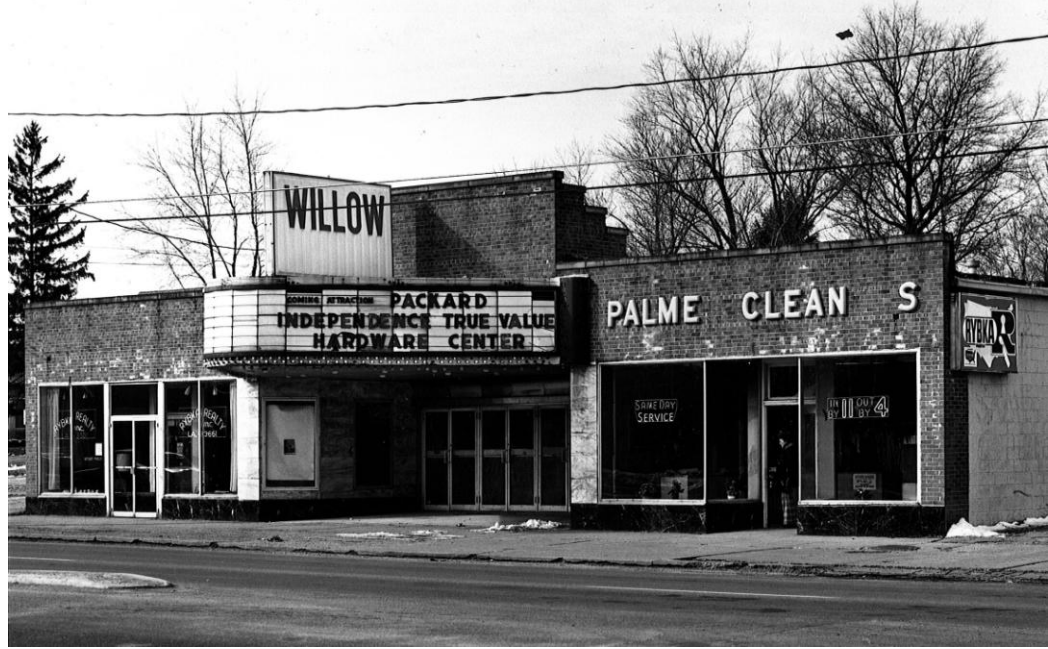
Decommissioned as a theater when this photo was taken, the Willow's marquee alerts the public that Packard Independence True Value Hardware will soon be built.

As I drive down Route 21 (I hate to call it BRECKSVILLE Road) through the center of town, I taken am back to Independence in the 1960s and the Willow, a 950 seat Art Deco movie theater that opened on June 22, 1950. The Willow was situated in the middle of the block surrounded by Brecksville Road on the east, Daisy Avenue on the north, Anderson Avenue on the west and Chestnut Road on